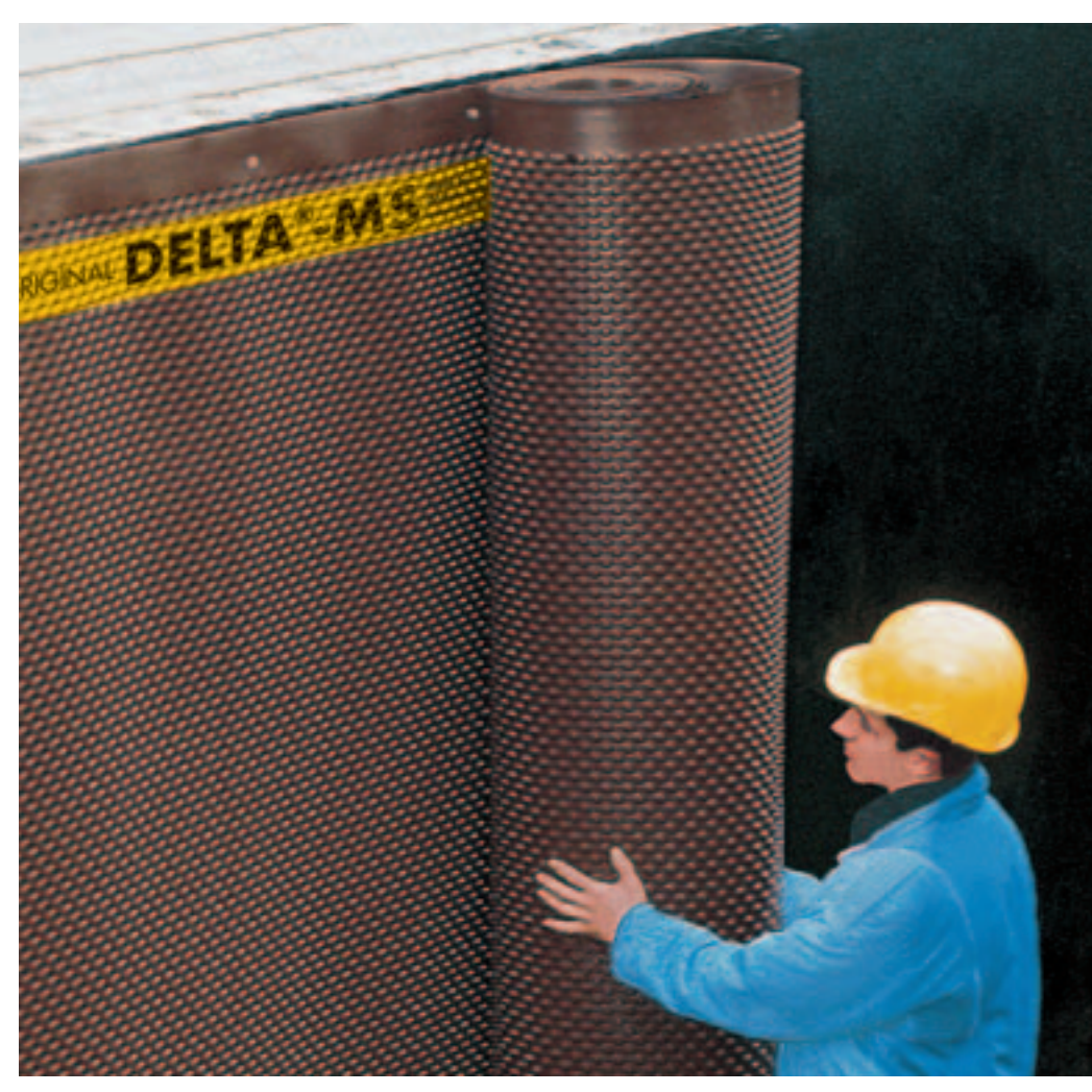
Easy to install, DELTA®-MS safely protects foundation walls.